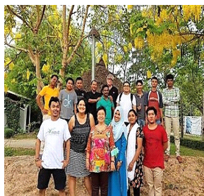
The participants of the meeting in Siem Reap on April 24-28, 2018.