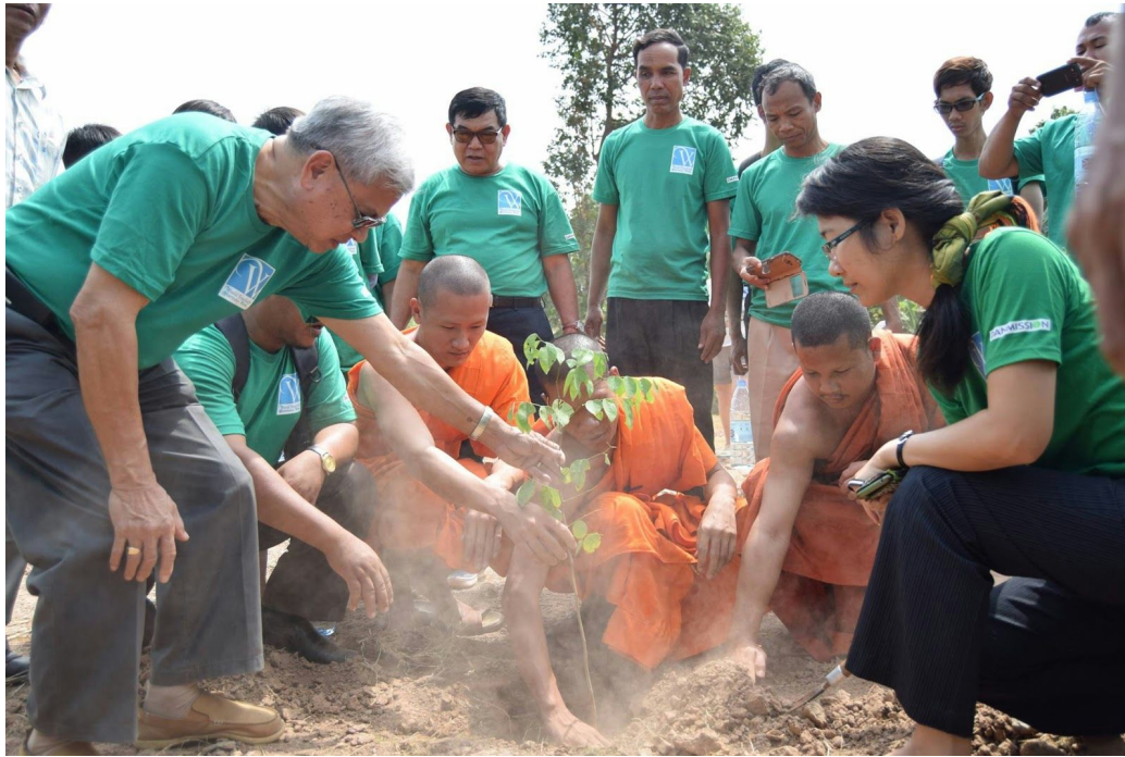
Participants of World Interfaith Harmony Week in Cambodia plant a tree for peace.

Following the meeting, some of the participants took the opportunity to explore Kuala Lumpur for one day before all returned to their homes.